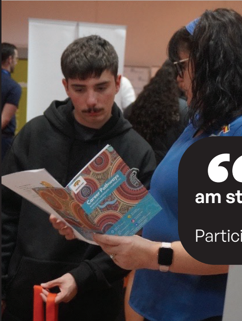
Rumbalara Cooperative and Ganbina Participant